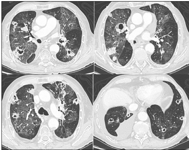
Figure 1 Chest CT scan with bilateral excavated nodules evoking lung abscesses, associated with diffuse bilateral ground-glass opacities.