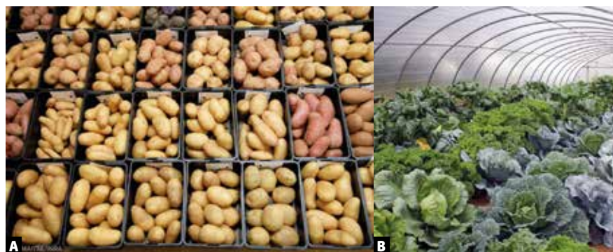
■ Figure 1A. A. Diversity of potato varieties. B. Diversity of cabbage populations.

The BrACySol BRC coordinates three national networks for the conservation of plant