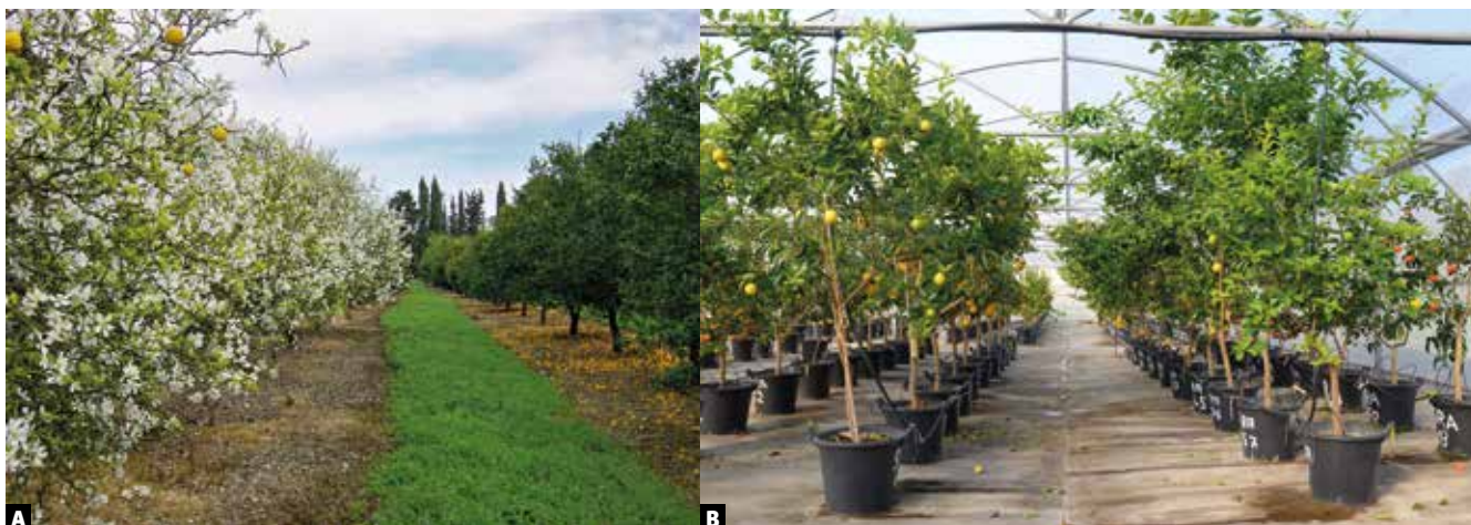
■ Figure 1C. A. Citrus field collection. B. Greenhouse citrus collection.

In addition to identifying the ancestral species at the origin of cultivated citrus, this information opens the way to new strategies for breeding based on a wide exploitation of the genetic resources of the species complex to generate the genotypes of tomorrow.