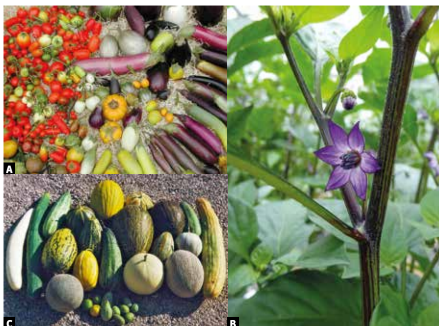
■ Figure 1K. A. An example of the fruit diversity of Solanum melongena (eggplant) and related species maintained at the “CRB-Leg”. Credit: CRB-Leg. B. A pepper ( Capsicum ) flower from one of the accessions of the Capsicum collection maintained by the BRC “CRB-Leg”. Credit: CRB-Leg. C. An example of melon ( Cucurbitaceae ) fruit diversity in the collections of the “CRB-Leg”. Credit: CRB-Leg.

sions through the INRAE database ( https://urgi.versailles.inra.fr/siregal/siregal/grc.do ). This database contains passport data and descriptions of each accession. It is linked to other databases such as Florilège (national database) and Eurisco (European database). The duty of the BRC-Leg is to carry out morphological descriptions in the open field or in greenhouse. Historically, this activity has mostly included traits related to the harvested product (fruit or leaves). Evaluation has so far typically focused on resistance to pathogens and fruit quality. GAFL scientists are developing research programs to include root traits in the plant descriptions. Both the patrimonial collections and the scientific genetic resources (segregating populations, mutants, etc.) of the BRC-Leg are used for research topics currently including: salt resistance in tomato (ERA-NET root project,