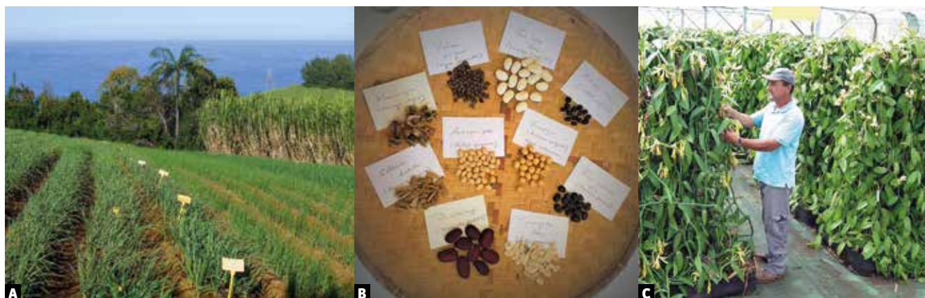
■ Figure 1J. A. Field maintenance of the garlic collection at a farm in Petite Ile (Reunion Island). B. Display of the diversity of vegetable seeds for educational purposes. C. Maintenance of the vanilla collection under insect-proof shade-house.