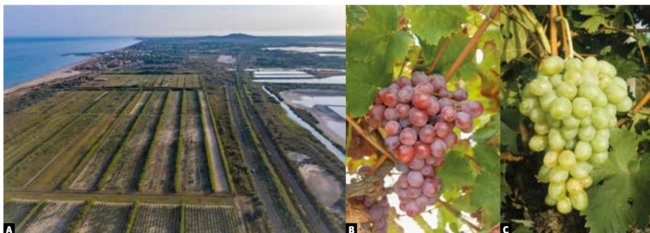
■ Figure 1D. A. Domaine de Vassal, field collection. Credit: C. Cruells. B. 'Italia Rubi' cultivar. Credit: BRC Grapevine. C. 'Malaga' cultivar. Credit: BRC Grapevine.

which brings together 36 professional partners from all wine-producing regions. The common database for this network is https://bioweb.supagro.inra.fr/collections_vigne/Home.php .