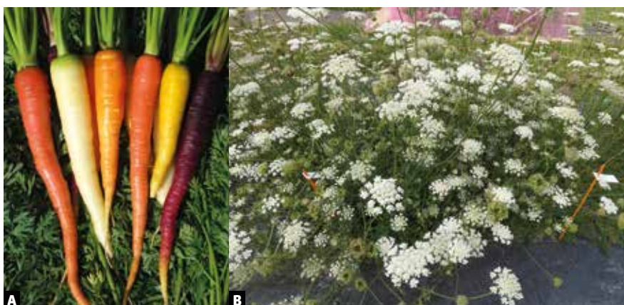
■ Figure 1B. A. Diversity of carrot root color. Credit: E. Geoffriau. B. Wild carrot umbels for seed regeneration. Credit: E. Geoffriau.

Bailleul, Porquerolles, Corsica) and a taxonomy expert (Via Apia). At European level, the BRC Carrot and other vegetable Apiaceae is the French representative on the ECPGR working group Umbelliferae (coordination 2008-2013), and is involved in ECPGR Carrot Diverse and EVA carrot projects. It coordinates collecting missions.