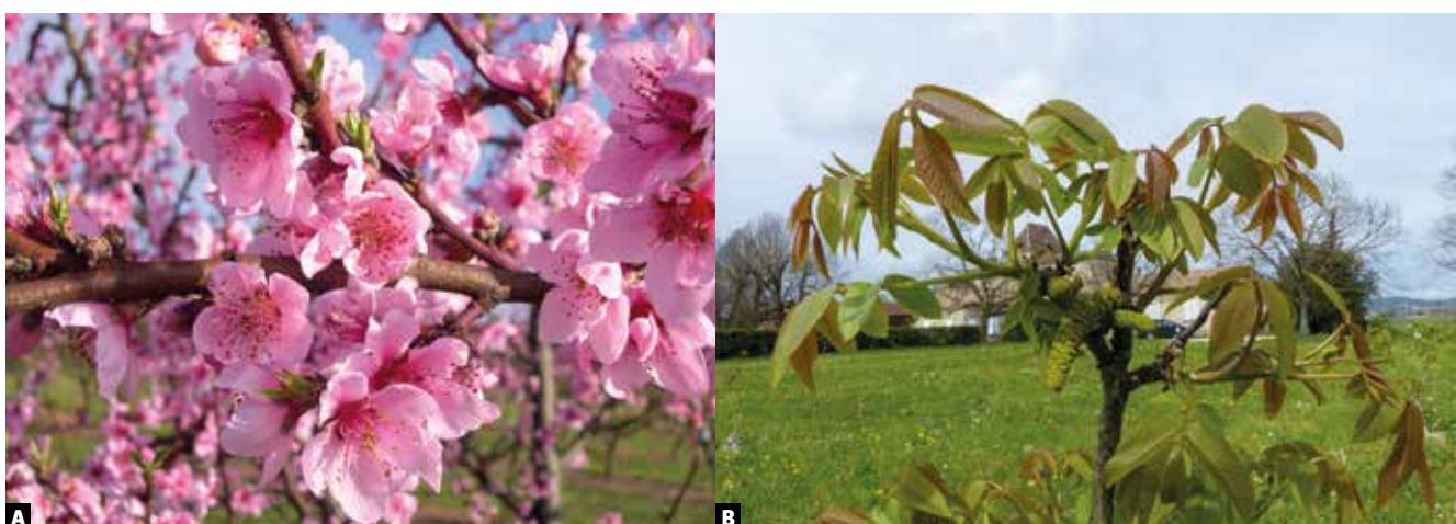
■ Figure 1F. A. Flowering Prunus from the Rose-pom collection. B. Flowering of walnut in new plantation.

physiology in a research project developing plant hormonal compounds in goat breeding.