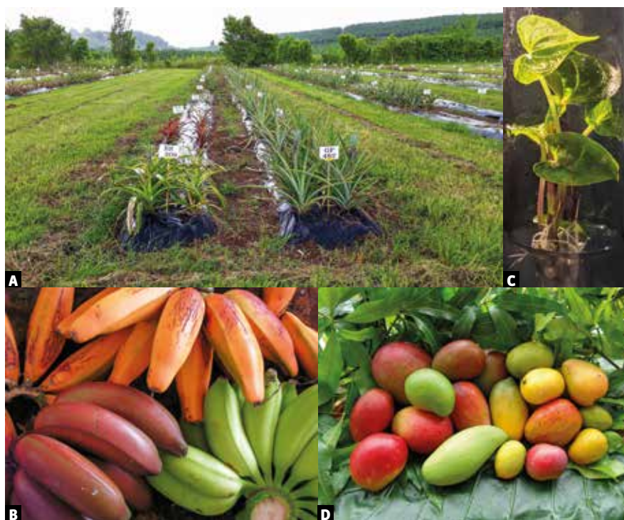
■ Figure 1I. A. Pineapple field collection in Martinique. Credit: M. Roux-Cuvelier. B. Diversity of banana fruit. Credit: BRC Tropical Plants. C. In vitro plantlet (yam collection). Credit: M. Roux-Cuvelier. D. Diversity of mango fruit. Credit: BRC Tropical Plants.

species. Seventy percent of the genotypes come from Africa. Recently enriched with heritage varieties from the French Caribbean Islands, this collection is used to diversify mango production.