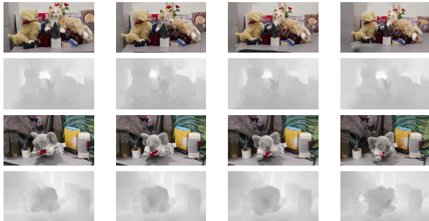
Figure 3: Color and depth results for Cat&dog and Elephant-wiggle scenes.

RGB intensities and gradients of I_t to be close to the intensities and gradients of I_{s,t} . Over the intensity term, adding the gradient term helps to recover a sharp image. The color diffusion relies on three weights: \sigma_D and \lambda_T serve the same function as in the depth map diffusion, and \lambda_G provides control over the gradient equality constraint. We set \lambda_G in the range 0.5–2.5.