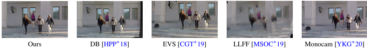
Figure 2: Comparison with other state-of-the-art IBR methods on the Jumping sequence.