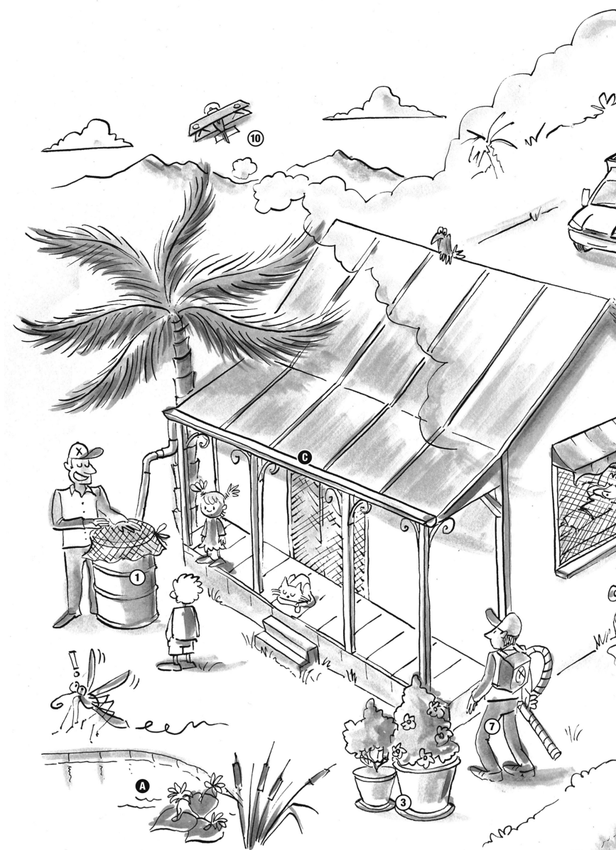
FIGURE 14.1 Suitable habitats for Aedes species and vector control methods. Aedes albopictus and Ae. aegypti breed in human environments. Ae. albopictus also develops in more natural habitats such as ponds, plants that hold water or tree holes (A). Both species are often found breeding in flower pots (B), gutters (C), water containers (D) and water collected in garbage of all sorts such as tyres, fridges and discarded containers (E). To reduce vector–human contact, several measures are used by people and public health authorities. Source reduction eliminates suitable places for females to lay eggs by properly covering