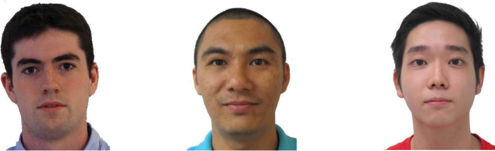
Figure 1. Sample stimuli used in the study. From left to right: Caucasian male, Malay male and Chinese male.

child faces (adult face bias). All photographs of faces were full-color images taken at a frontal position on a white background.