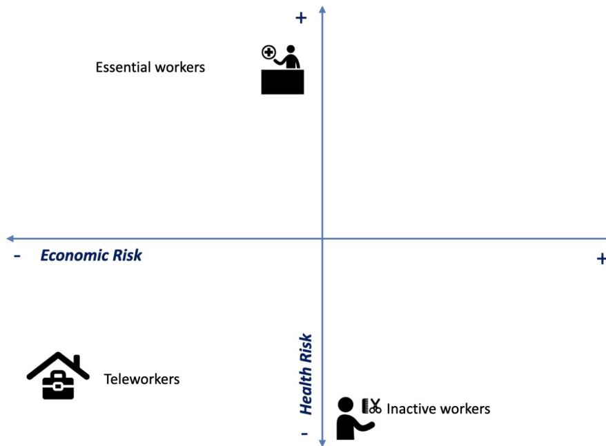
Figure 1: Mapping of different types of workers to the type of risk incurred. The horizontal axis represents economic risk (left = low, right = high), the vertical axis represents health risk (bottom = low, top = high). The position of each group on the diagram is indicative.