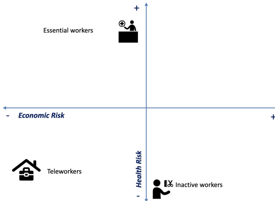
Figure 1: Mapping of different types of workers to the type of risk incurred. The horizontal axis represents economic risk (left = low, right = high), the vertical axis represents health risk (bottom = low, top = high). The position of each group on the diagram is indicative.