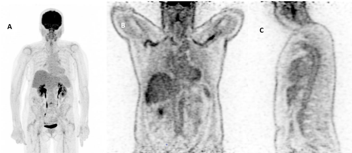
Figure 2. PET-CT of patient n°2

A: PET-CT at diagnosis in December 19, showing slight hypermetabolism of glenohumeral and coxofemoral joints without vascular hypermetabolism. B and C: PET-CT 2 years later and 23 days after her first dose of COVID19 vaccine, showing a panaortic and supra-aortic vasculitis.