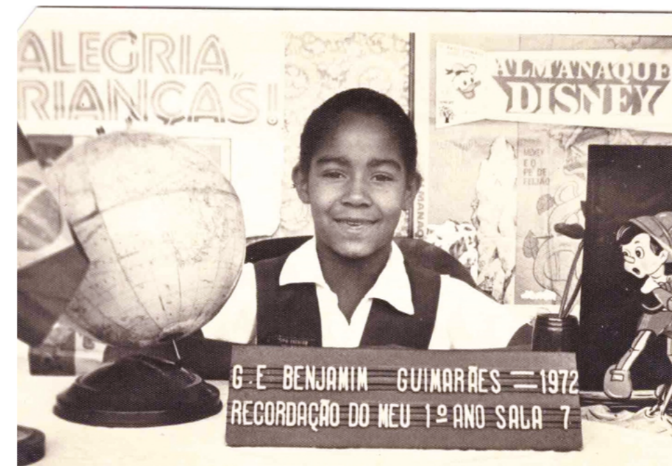
First year at the Concordia neighborhood school.

In the early years of Elementary School, I studied at the Benjamin Guimarães State School, which also was also in the neighborhood. It was a little further, but I also went alone and arrived early. I loved to study, I never skipped it. I don't remember starting to miss it until the third grade, because I would go to school even when I was sick. I learned to read early on, I was one of the first in the class to learn, I liked to read stories. I wrote an essay for a competition by the Education