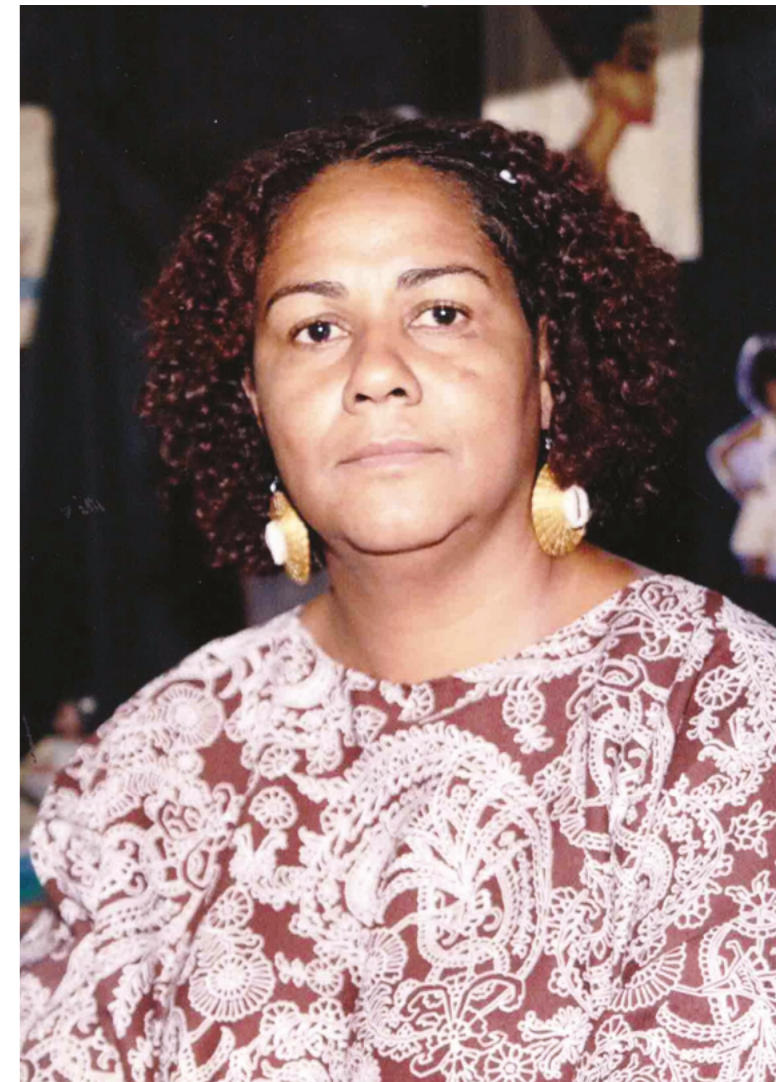
As Principal of Florestan Fernandes Municipal School. Belo Horizonte, 2008.