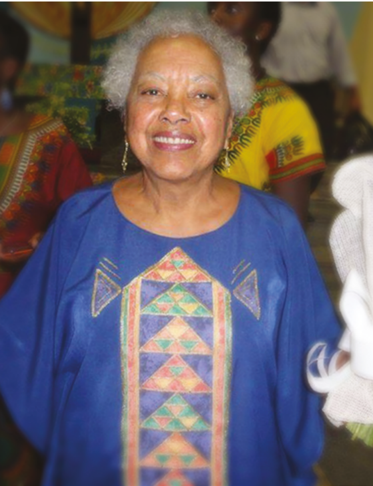
Diva at the Church of Jesus Crucified, participating in Rosário festivities. Belo Horizonte, 2016.