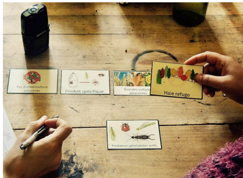
Fig 1: Using visual cards to elicit a stakeholder’s perceptions of probabilities of cause–effect relationships in agroecological pest management. These were then used to link the different nodes of the Bayesian belief network.

The parametrization of the BBN was an onerous task (time consuming and not always intuitive), so to facilitate the process, we used cards with images (Fig. 1) to illustrate variables and their different states. We also opted for questions about frequency (“Considering A, B and C, in how many cases out of 100 would you observe D?”) rather than probability, which is more difficult to handle cognitively (Anderson, 1998). The whole process (to elicit the 266 probabilities of the network) lasted three hours per stakeholder. Once the probabilities were collected, we presented the compiled model to each participant and asked him/her to validate it, providing it reasonably captured their own perspective of the system.