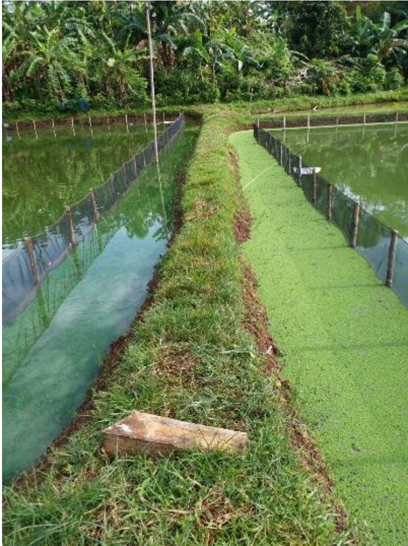
537 Figure 1. Space between the banks and the anti-predator net (1 m) in a conventional pond 538 (on the left) and the same space covered by A. filiculoides in a co-cultured pond (on the 539 right). Both types of ponds have fence nets to protect fish from predators (Photo IRD - J. 540 Slembrouck).