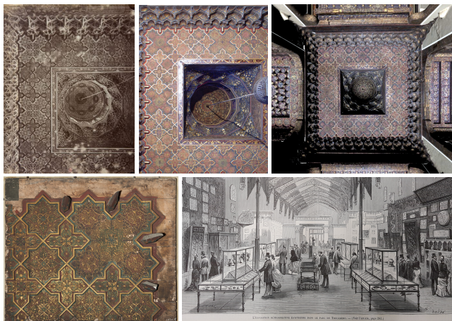
Figure 2: The ceiling of the main lounge as it appears in photographs (upper-left, 1887 by Beniamino Facchinelli – Bibliothèque de l’Institut national d’histoire de l’art, Paris France), in the current French Embassy in Cairo (upper-center, photographs by Dominique Roux – 2001 and upper-center, our 3D acquisition – 2019) and as cast (or original?) in the collections of the Victoria and Albert Museum (lower-right). The latter was displayed during the 1878 Universal Exhibition in Paris (as shown in the lower-left, L’Illustration , n° 1872, 2nd of November 1878, p. 277).

Universal exhibition was reinstalled as an artistic studio and residence near Paris [Vol09]. Part of the Pavillon des Indes , presented by Great Britain at the 1878 Universal Exhibition, survives today in the vicinity of Paris (Courbevoie).