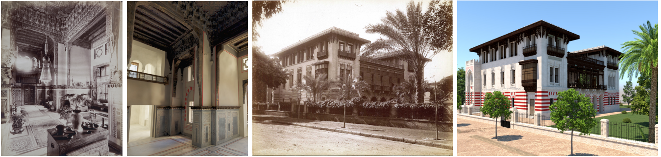
Figure 5: Two views of the 3D restitution of the Saint-Maurice residence compared with historic photographs. Left – the main lounge decorated all the ornaments we had acquired. Right – an external view.

these data, together with our approach based on the full use of this information and the supervision of an expert of the Saint-Maurice residence, has led to a first and rigorous 3D restitution (Figure 5).