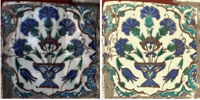
Figure 4: Left: An hyperspectral image of an Iznik ceramic tile (converted in RGB). Right: Image obtained by classifying each spectrum of each pixel in 8 groups.

with or without cutting, with or without repainting. The issue of repainting required some material and appearance characterization in order to achieve a more realistic visualization. An acquisition of appearance was thus carried out in order to characterize the reflectance of the materials used. However, such an acquisition has several constraints. First, it is an on-site acquisition of SVBRDF with a ceiling over 10 m long at 7-m high. Light dome methods (e.g., [SWRK]) cannot be applied at such a scale and on-site, because of portability and sample size. Moreover, as mentioned before, there were significant time limitations to our measurements. Reflectance Transformation Imaging (RTI) [MP18] therefore seems to be interesting because of its speed and its installation in an uncontrolled lighting environment. However, RTI only uses a single light probe, approximates the light source used as being at infinity and has only one point of view. Rigorous appearance acquisition implies to multiply images with different points of view and positions of light, and to record precisely these positions with respect to the studied object. For this, we adapted the method of Corsini et al. [CCC08] by placing two lights probes and a fixed camera in front of the scene.