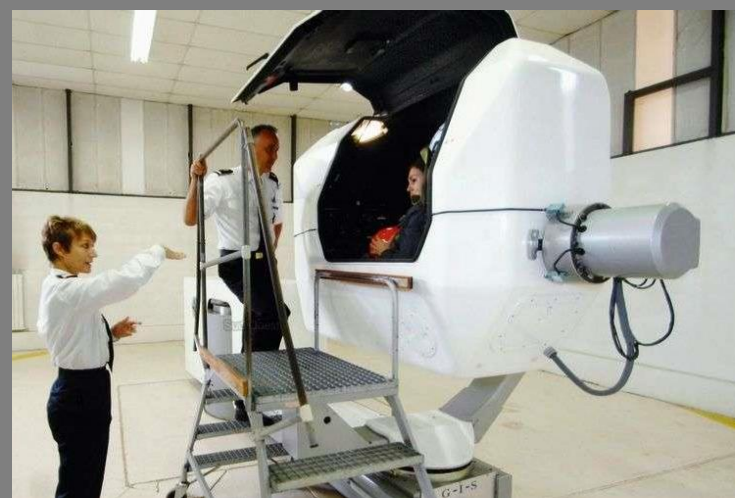
Sensorial Illusion Generator