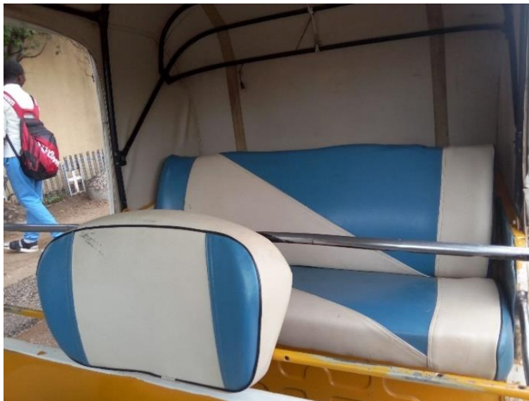
Fig. 23. Fig. 24.

The second major decorative elaboration involves fixating fabrics of different materials and motif patterns onto the tarpaulin ceiling and side- and back-covers of the tricycle. This covering stands in contrast to seat designs as they never incorporate the same motifs or