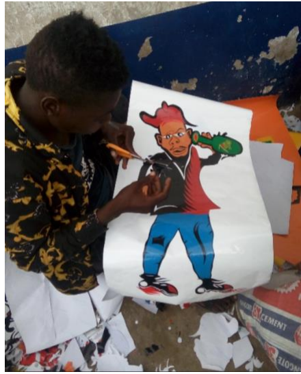
Fig. 39.