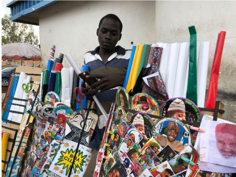
Fig 31. Fig. 32