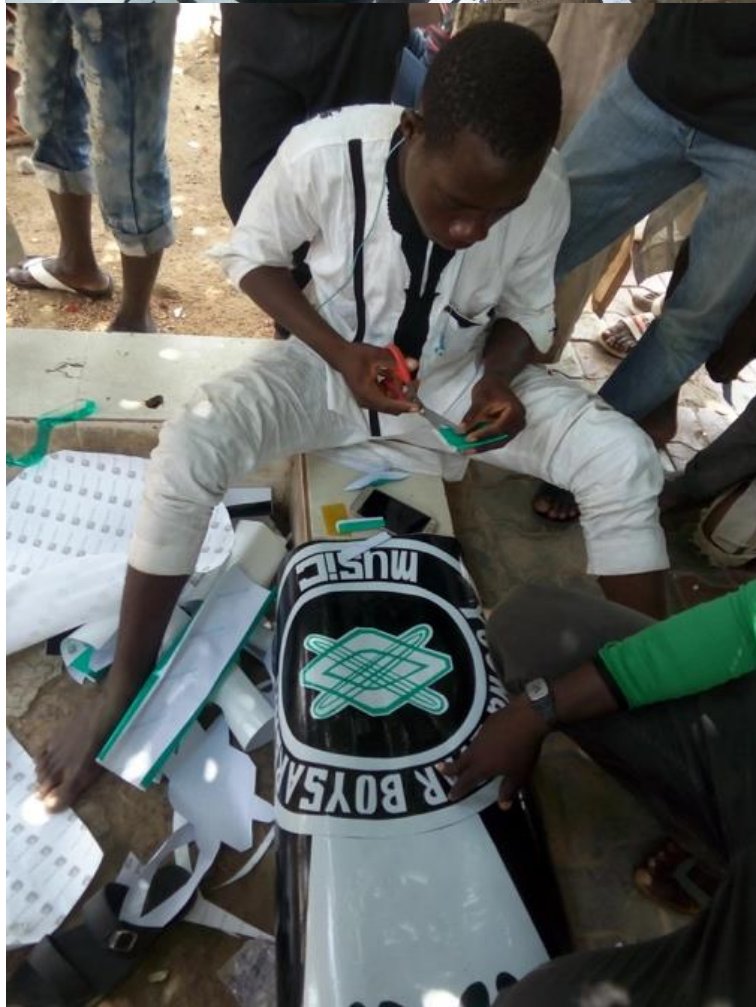
Fig 37. Photo by Oluwaseun Williams Fig 38. Photo by Oluwaseun Williams