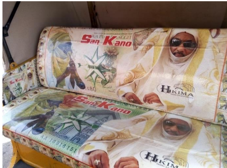
Fig. 5. Photo by Oluronke Popoola Fig. 6. Photo by Oluronke Popoola