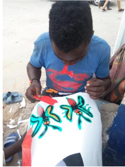
Fig. 40.