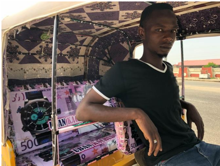
Fig. 29.