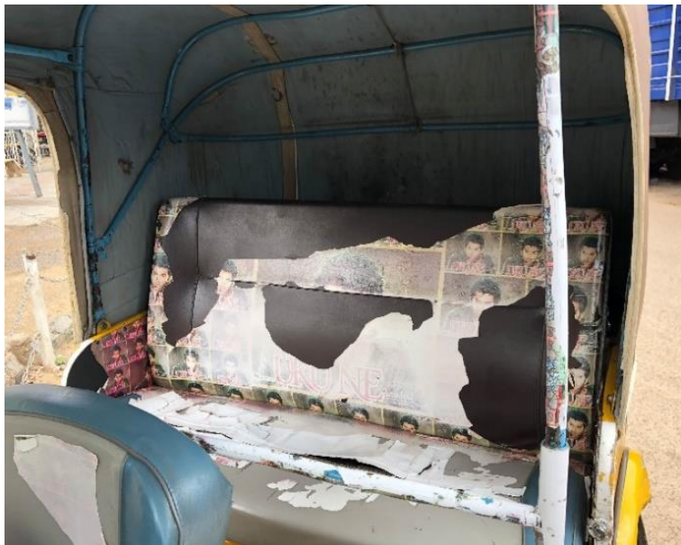
Fig. 21. Photo by Brian Larkin Fig. 22. Photo by Brian Larkin

Because of the cost and short life of printed sticker vinyl, not all decorated tricycles follow this form. Others use stronger materials that offer colour and last longer, while still others have their seats and backrests covered in yards of fabrics with floral patterns