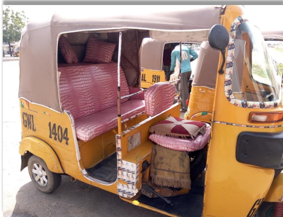
Fig 1, Adaidaita Sahu Kano.