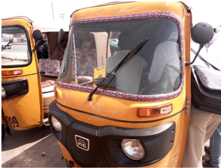
Fig 18. Rim design.

The design of the seats is both patterned and individualized drawing on a medley of images and themes in the pictures captured on the SAV stickers. It is common to find Nigerian hip-hop artistes (such as Wizkid, Olamide, Davido, Reekado Banks), international pop artistes, local Hausa artistes (such as Alan Waka and Lil Amir), Reggae musicians (particularly Bob Marley), Bollywood/Kannywood actresses, popular cartoon characters like Mickey Mouse, as well as local traditional authorities particularly the Emir of Kano. All of these are usually laid over a background of different currency notes from diverse countries and have superimposed over them expensive watches and symbols from international brands – most especially Gucci which was one of the most widely disseminated patterns used in decoration. Military symbols like crossed guns, beret, skull, are used. Any or all of these elements are combined to make each seat a pastiche of images, symbols and colours that draw upon this reservoir of patterns and elements. Drivers then personalise this design by adding text such as Ka Huta (Relax, see figs 8, 9), their name (fig 10), their group (Arewa Empire Mates, fig 5) or their area of origin (i.e. Ajumawa,