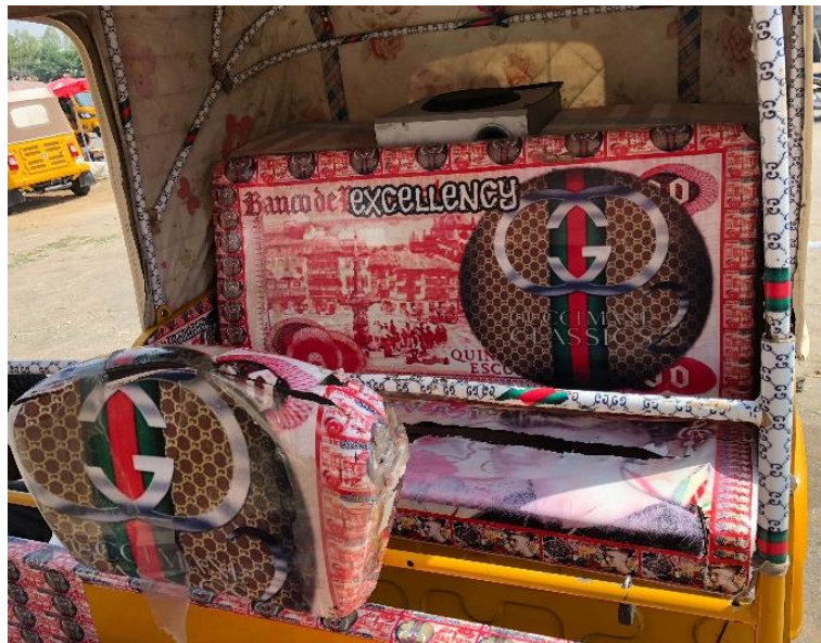
Fig. 7.