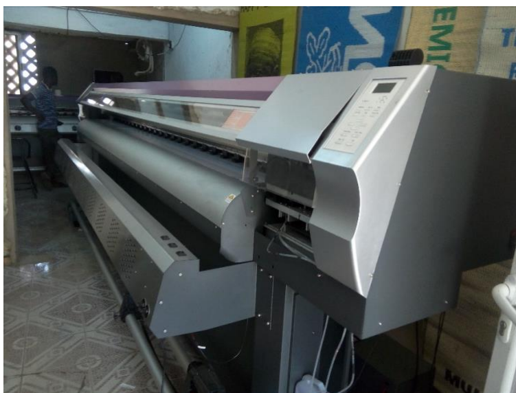
Fig. 19. Printing studio. Fig. 20. Large format SAV printer