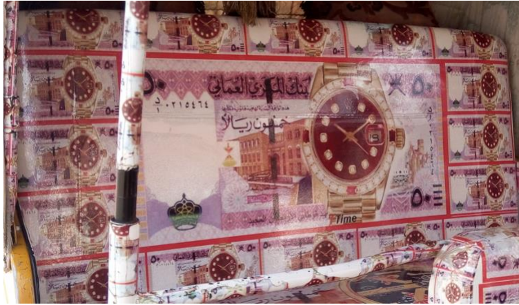
Fig. 42.