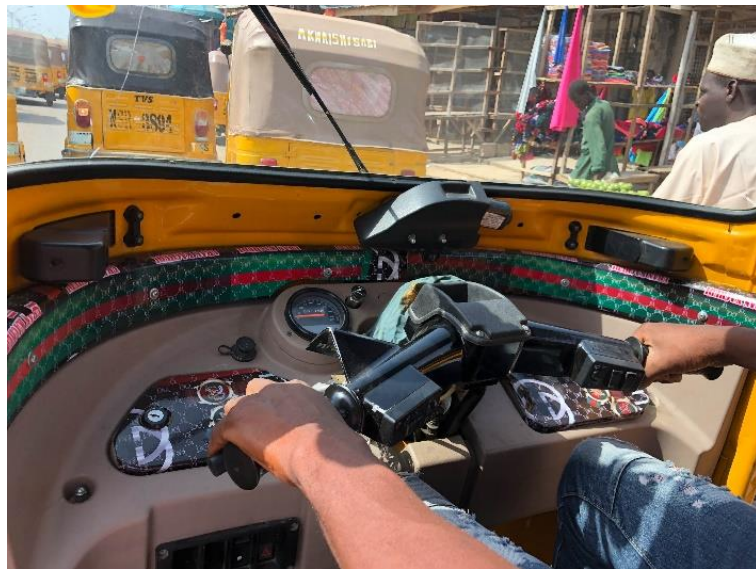
Fig. 14. Photo by Brian Larkin Fig. 15. Photo by Brian Larkin