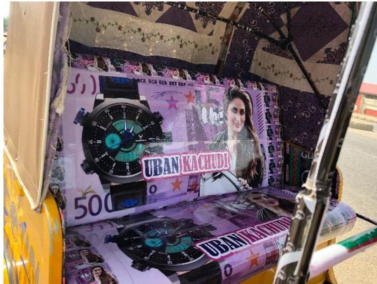
Fig. 9. Photo by Brian Larkin Fig. 10. Photo by Brian Larkin