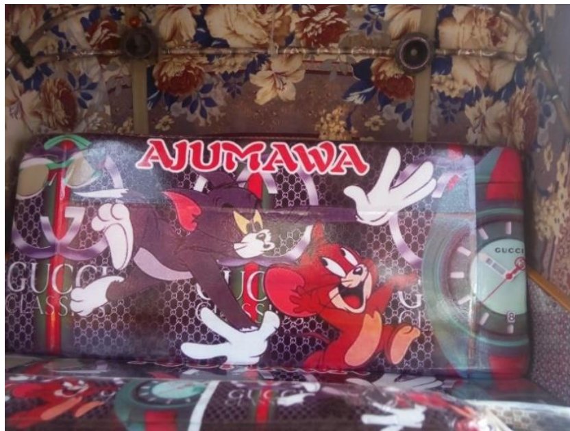
Fig. 3 Photo by Oluwaseun Williams Fig. 4. Photo by Oluwaseun Williams