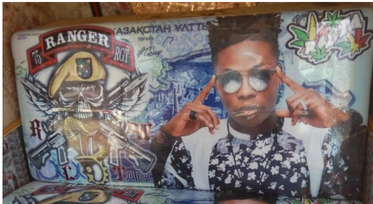
Fig. 43.

One other distinct aspect of these designs is that the use of painted slogans on the sides and windows of taxis and buses (which have been extensively analysed) has dwindled. What has replaced these slogans is a hybrid series of images that blend of transnational icons with local Hausa symbols and concepts. Southern Nigerian singers, Indian film stars, Bob Marley and other iconography of rasta culture indicates connections to broader black public culture that is combined with Western cartoon characters, and local motifs from images of the Kano Emir blended with the tambarin Arewa (the popular icon of Northern Nigeria).