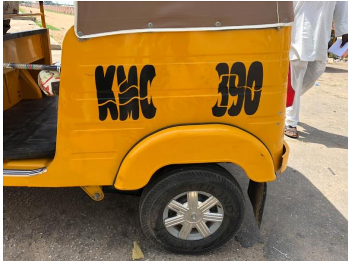
Fig 2: Registration number. Note how even this number is designed by hand in a unique calligraphy by roadside artists rather simply stencilled.

the country, all are required to use interior lights to illuminate the inside of the tricycle in the evening so that security operatives would be able to see the people and what goes on inside the tricycle even from a distance.