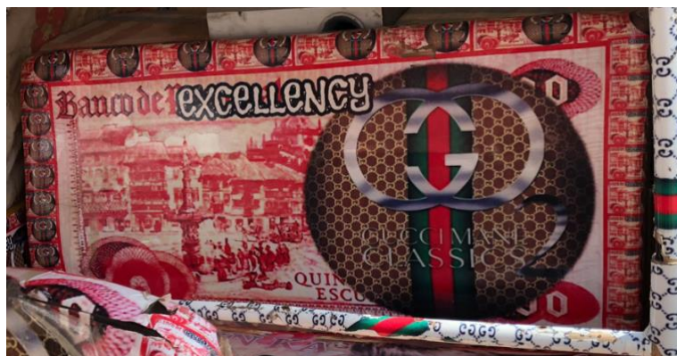
Fig 41.

What most marks these designs is the theme of wealth. Many printed SAV stickers use a background of currency from all over the world over which are imposed images of watches or wealthy brands such as Gucci (see figs 41-43). Where Agbiboa sees vehicle design as a means of dealing with the harshness and precarity of urban life, for many northern drivers, operating a tricycle was a means of advancement, something to be proud of, and the investment into decorating and maintaining tricycles was evidence of this. This is why it is common to see riders using dusters to clean dust and any other forms of dirt from their tricycles at the slightest opportunity, particularly while waiting in traffic. It indicates a sense of self-accomplishment that a rider derives from owning or riding a well-decorated tricycle. For instance, Mohammed, a rider, we spoke to, saw riding a tricycle he decorated as a feat of social mobility now that he is riding a decorated tricycle as he was previously a peddler of goro (kolanuts).