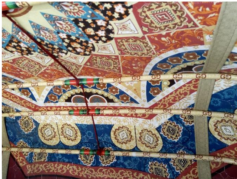
Fig. 27. Fig. 28.