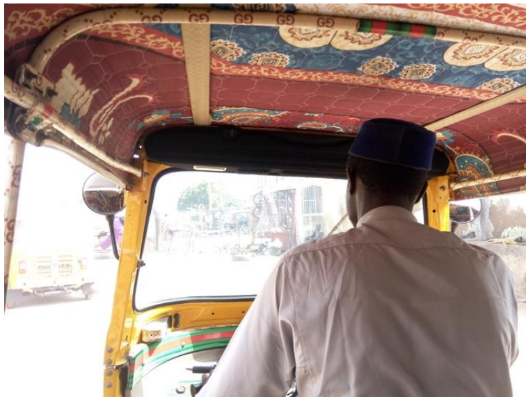
Fig. 25. Fig. 26