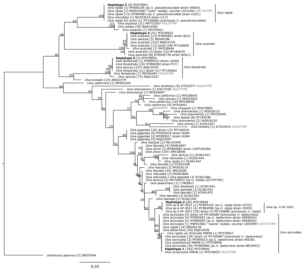
Figure 2 Maximum Likelihood (ML) phylogeny based on 500 bp of the tufA chloroplast gene. Haplotypes detected in this study are in bold. Bootstrap support values from the ML analysis are indicated under each node. Sample size, for each haplotype, is presented in brackets. Unit of scale bar: substitution/site. MNHN: Muséum National d'Histoire Naturelle, Paris. Taxon names follow Genbank records, as of the time of publication.

Full-size DOI: 10.7717/peerj.11966/fig-2