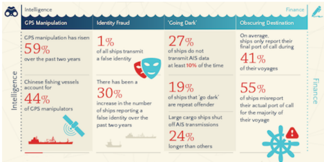
Fig. 1. Statistics concerning AIS frauds realised by Windward [7].