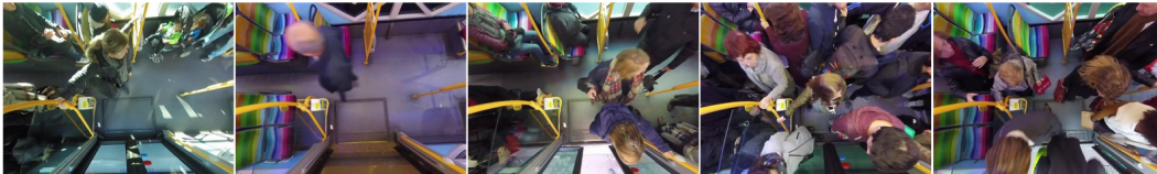
Figure 3. Illustration of the variability of the scenes in our database in terms of lighting, passenger appearance and environment clutter.

This distribution is chosen in order to have sequences of all types both in training and validation/testing sets i.e. with different illumination conditions and scene clutter.