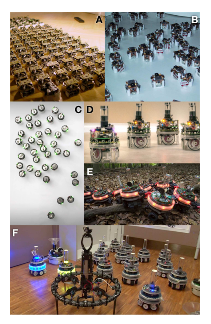
Figure 2. Some of the robots largely used in swarm robotics research: (A) jasmine [67]; (B) alice [20]; (C) kilobots [109]; (D) e-pucks [83]; (E) swarm-bots [84]; (F) swarmanoid [32].

One of the first international projects to investigate cooperation in a swarm of robots was the Swarm-bots project, funded by the European Commission between 2001 and 2005. In this project a swarm of up to 20 robots capable of self-assembly i.e., physically connecting to each other to form a cooperating structure—were used to study a number of swarm behaviours such as collective transport, area coverage, and object search [36], [84]. The main result of the project was to demonstrate what—at the present day—remains the only example of self-organised teams of robots that cooperate to solve a complex task, with the robots in the swarm taking different roles over time [92]. The Swarmanoid project (2006-2010) extended the ideas and algorithms developed in Swarm-bots