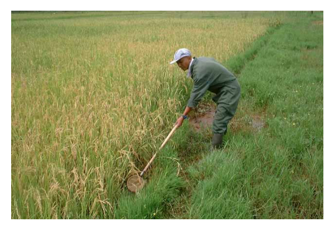
Figure 4 Illustration of the net method.