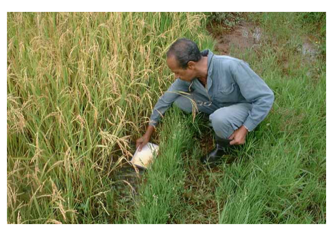
Figure 3 Illustration of the dipping method.

ethanol before being studied under the microscope (note that we were unable to classify six of the 2<sup>nd</sup> instar larvae in the genus Culex to species level). This study was carried out in Madagascar, in the Fianarantsoa province and both methods were repeated three times in different rice fields: Rice field A, 3 km W Amborompotsy, S 20° 36.6', E 46° 16.1', alt 1068 m, Rice field B, 15 km E Amborompotsy, S 20° 35.9', E 46° 19.4', alt 1266 m, and Rice field C, 10 km W Ambositra, 1 km N Andina, S 20° 30.8', E 47° 09.0', alt 1326 m. No vector control programme exists in locations A and B, but the third rice field is located in an area in which DDT has been sprayed for several years. The approximate depth of the water was 5–10 cm.