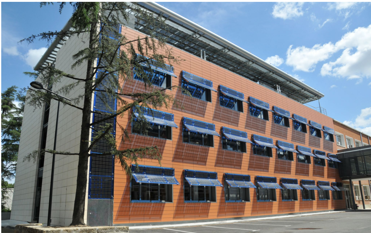
AFRISOL 3 : a sensorized smart building in Madrid (this is a pilot building for the project investigating the use case described here)

A key aspect is that the input data can vary in frequency, relevance, amount of available data, etc. This can lead to variations in data provisioning, that will induce variations of the computational/processing workloads; this requires dynamic reallocation of processing tasks and resources across the CC; at the same time, this will result in a more/less intensive computation for learning behavioural models, and, lastly, to a modification in the forecast and hindcast calculation due to better match actually observed data. This variability does require support for seamless data processing across the CC and also smart, dynamic scheduling, as well as allocation of processing tasks, to react to data variations.