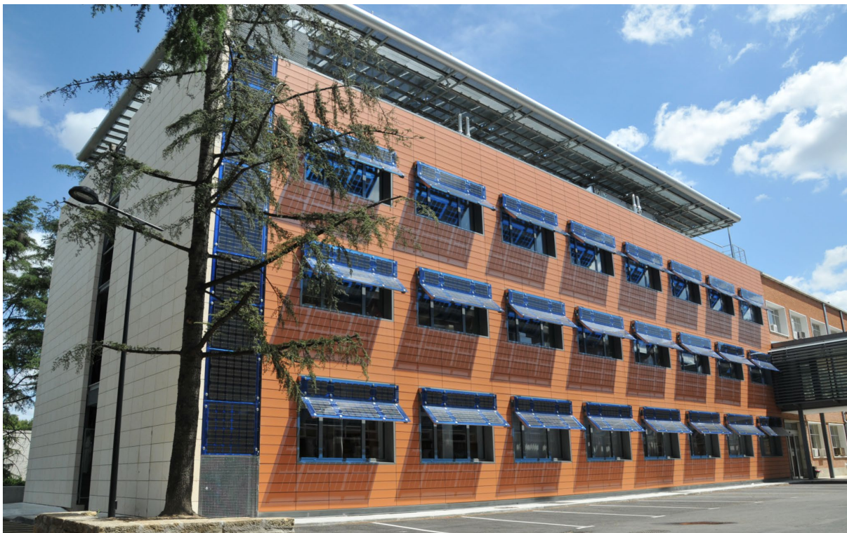
AFRISOL 3 : a sensorized smart building in Madrid (this is a pilot building for the project investigating the use case described here)

A key aspect is that the input data can vary in frequency, relevance, amount of available data, etc. This can lead to variations in data provisioning, that will induce variations of the computational/processing workloads; this requires dynamic reallocation of processing tasks and resources across the CC; at the same time, this will result in a more/less intensive computation for learning behavioural models, and, lastly, to a modification in the forecast and hindcast calculation due to better match actually observed data. This variability does require support for seamless data processing across the CC and also smart, dynamic scheduling, as well as allocation of processing tasks, to react to data variations.