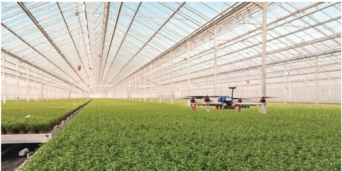
A sensorized greenhouse

The use case scales by including more greenhouses, growers and regions.