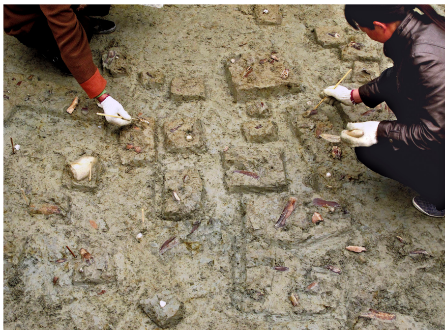
Figure 2: The 2011 excavation at Lingjing (Xuchang, Henan, China): Layer 11, Trench 11.

Two fragmented, incomplete human skulls (Xuchang 1 and Xuchang 2) were excavated in Layer 11, in situ between 2007 and 2014 (Li et al. 2017a; Trinkhaus and Wu 2017). Xuchang 1 (26 pieces) is the most complete; it retains most of the neurocranial vault and portions of the cranial base, as well as part of the left frontal bone. Xuchang 2 (16 pieces) is less complete with large part of the occipital bone and the temporal bones (see Li et al. 2017a). The Xuchang Man skulls derive from young adults and exhibit a mosaic of morphological features with differences from and similarities with their western contemporaries, which suggests complex dynamics between Eastern and Western Eurasian populations at the time. Given their low and broad neurocrania with the maximum breadth inferiorly, they are considered as eastern Eurasian late archaic hominins (Li et al. 2017a; Trinkhaus and Wu 2017). Both skulls exhibit external auditory exostoses most pronounced in Xuchang 2 implying conductive hearing loss (Trinkhaus and Wu 2017).