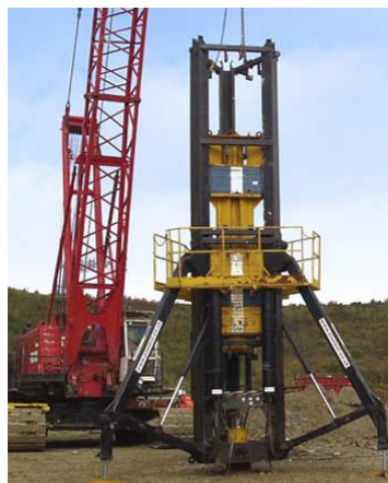
FIG. 5 – STATNOMIC load capacity testing equipment.

In course of the pile driving it is possible to verify constantly the pile bearing capacity assumed in the original design. The basis for the bearing capacity control is the counting of the blows required for each 20-centimeter penetration of the pile. Such measurement makes it possible to test (evaluate) pile bearing capacity right away on the building site. However, when geotechnical conditions vary from the expected, Pile driving analysis may lead to false results. This happens, when a weak layer appears below the pile toe. Such a fact may be neglected by the pile driving analysis, but may seriously affect a long time behaviour of the pile.