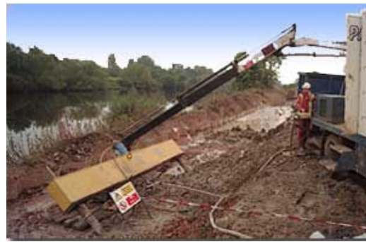
FIG. 4 – Static test of an inclined pile

In course of the pile driving it is possible to verify constantly the pile bearing capacity assumed in the original design. The basis for the bearing capacity control is the counting of the blows required for each 20-centimeter penetration of the pile. Such measurement makes it possible to test (evaluate) pile bearing capacity right away on the building site. However, when geotechnical conditions vary from the expected, Pile driving analysis may lead to false results. This happens, when a weak layer appears below the pile toe. Such a fact may be neglected by the pile driving analysis, but may seriously affect a long time behaviour of the pile.