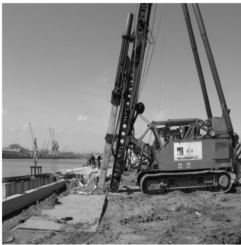
FIG. 3 – Driving in of an inclined pile.

The pile driver mast may be inclined in the wide range of angles. However, for the sake of the machine stability, if the pile length exceeds 12 meters, the possible inclination of the mast is limited to 30 deg. The designing of inclined piles allows to reduce the dimensions of pile capping beam, as well as to transfer significant part of horizontal forces (fig.3). Static load test of an inclined pile seem to be a difficult work but it can be performed (see fig.4).