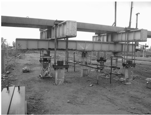
FIG. 1 – Static load testing stand