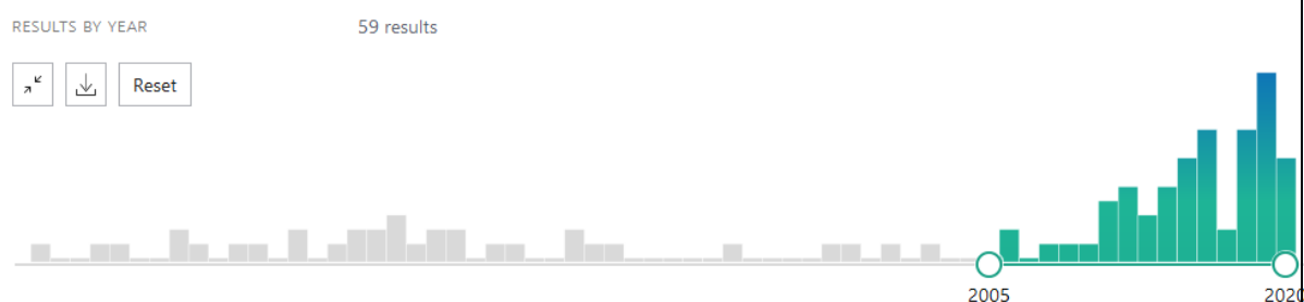
Figure 1 – Yearly visualization of works found on PubMed. In grey, we can see all available publications (1957-2020) and, in turquoise, our included sample (2005-2020). The number of publications by decade is: 1950s – 1; 1960s – 7; 1970s – 15; 1980s – 6; 1990s – 3; 2000s – 6; 2010s – 48; 2020s – 7.

Results of our request on PubMed (93 articles) highlight that, while, during several decades, students' mental health topic was often neglected, the number of publications has considerably raised over the last 15 years (2006-2020) (Figure 1).