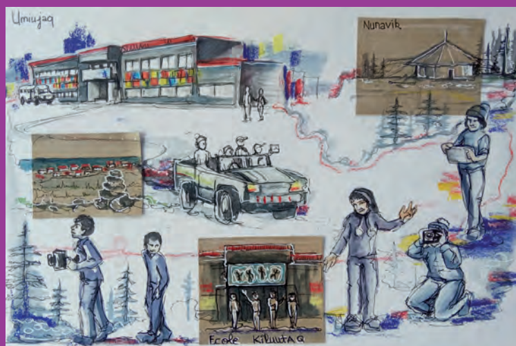
Drawings illustrating the different phases of the video-making process during a workshop in Nunavik's school (watercolor pencil painting done by Orsane Rousset, 2021). This artistic mediation helps to motivate new schools to participate in workshops, which in turn enables researchers to enrich the data on local environmental perceptions.