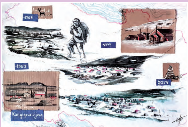
A journey through space and time, illustrated by the moving character; one notices the superposition between the landscape and its topographic representation. During the first decades, the life of the village is turned towards the cove; at the end of the 1990s, it is the avalanche slope that is represented as well as the building/people at stake located at its foot; then the most recent years show rather an expansion towards the valley (watercolor-colored pencil painting based on the authors' fieldwork, done by Orsane Rousset, 2021).