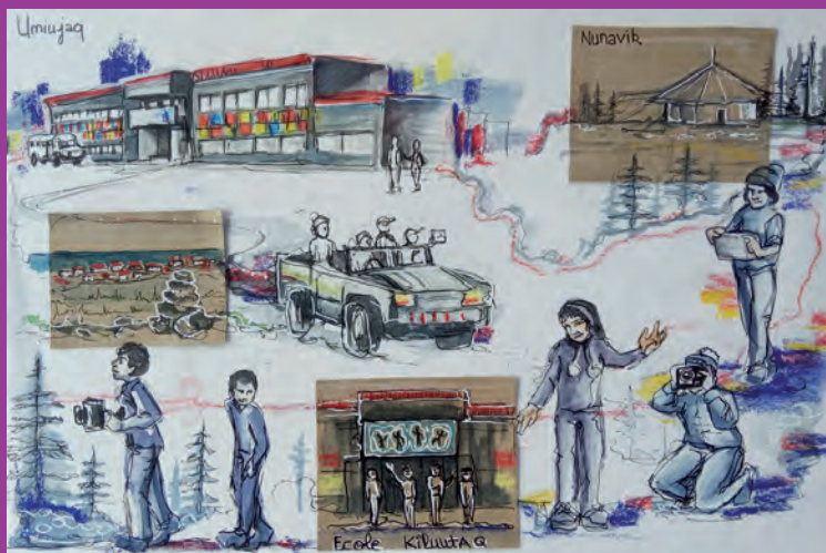
Drawings illustrating the different phases of the video-making process during a workshop in Nunavik's school (watercolor pencil painting done by Orsane Rousset, 2021). This artistic mediation helps to motivate new schools to participate in workshops, which in turn enables researchers to enrich the data on local environmental perceptions.