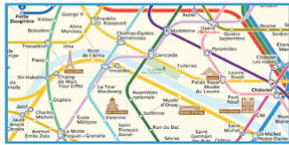
Figure 3: Metro map connections in Paris

Decomposition is the process of breaking-down something in smaller parts. In some metro lines, there are bi-directional destinations: users should study the metro signs and define in which train destination they should step. Consequently, they decompose their travel itinerary in a simplified way so that they would choose wisely the metro lines that they should take.