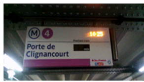
Figure 4 : Information panel in Parisian metro

Blinking-light patterns on the metro station panels indicate that the train is approaching the platform (Figure 9). Even if the users who are far away and they cannot exactly identify the remaining time on the panel, when the light is blinking that shows that the train is almost there.