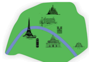
Figure 5: Landmarks in Paris (image created by Elli Sarrou)

In this case, the Parisian railway map is quite confusing as most of the big cities' public transportation maps (Figure 10). What users need to do for optimizing the way that they should take (from an A to a B point) is to identify a series of steps for reaching their goal destination (get into the station/first take the line x/stop at the metro station y/take the line z/then exit).