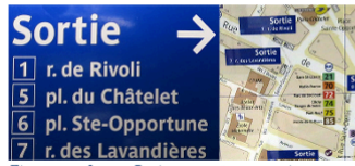
Figure 2: Paris metro exit map

Abstraction is the process of excluding unnecessary information and focusing on the details that matter. With the example of the metro map users should disregard information on the buses around the area and in first place find the street from the list on the right and in the second place identify the closest exit (exit's number) of their destination.