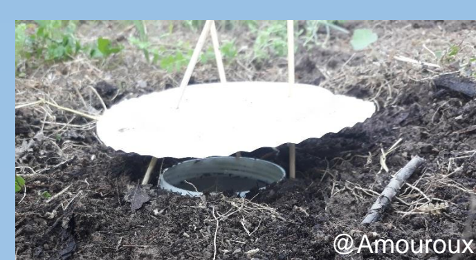
Fig. 3: Pitfall trap