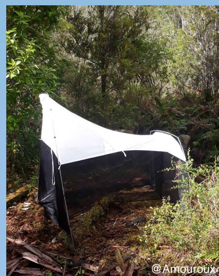
Fig. 2: Malaise trap