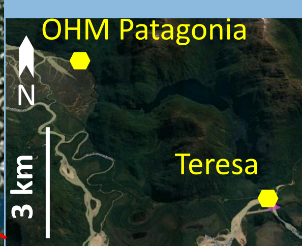
Fig. 1: Localization of the two sampled sites. Modified from Google Earth.

How Using pitfalls (Fig. 3), pan traps, night light traps, flight intercept traps, Malaise (Fig. 2), and active collecting (diurnal and nocturnal)