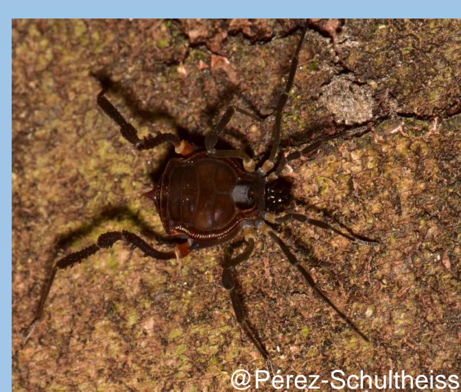
Fig. 5: Opiliones

Who CRUSTACEA: Isopoda (Fig. 4) and Amphipoda ARACHNIDA: Opiliones (Fig. 5) INSECTA: Orthoptera, Hemiptera, Coleoptera, Lepidoptera, Hymenoptera and Diptera.