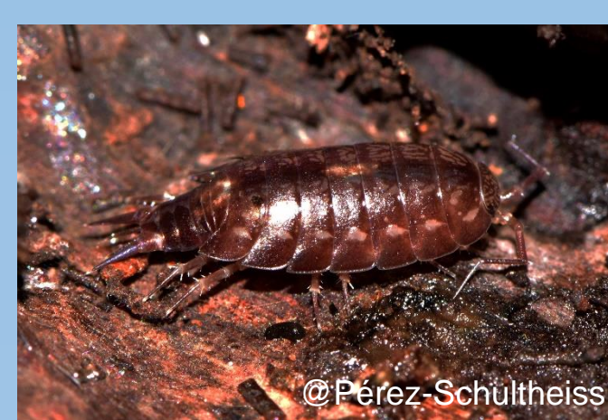
Fig. 4: Oniscoidea

How Using pitfalls (Fig. 3), pan traps, night light traps, flight intercept traps, Malaise (Fig. 2), and active collecting (diurnal and nocturnal)