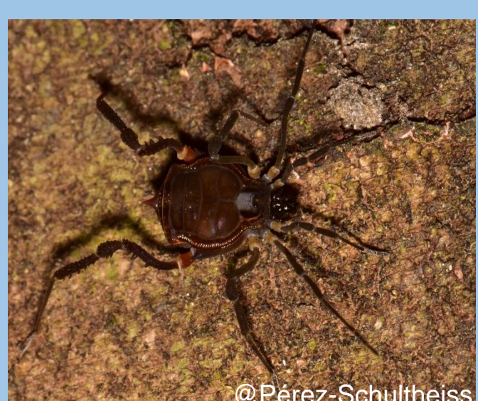
Fig. 5: Opiliones

Who CRUSTACEA: Isopoda (Fig. 4) and Amphipoda ARACHNIDA: Opiliones (Fig. 5) INSECTA: Orthoptera, Hemiptera, Coleoptera, Lepidoptera, Hymenoptera and Diptera.