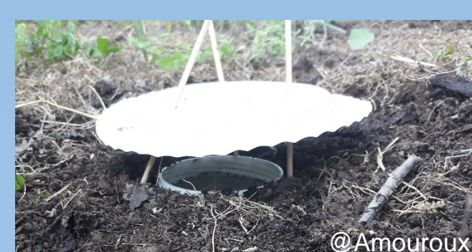
Fig. 3: Pitfall trap