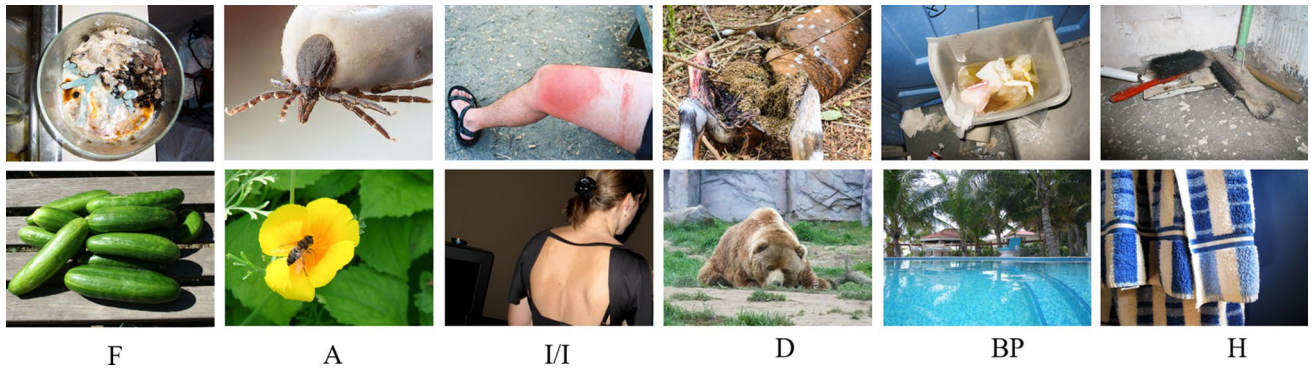
Fig. 1 A subset of the types of disgusting (upper row) and neutral (lower row) images used for food (F), animals (A), injuries/infections (I/I), death (D), body products (BP), and hygiene (H) categories

After completing the paper-and-pencil questionnaire, each participant was invited to sit in front of a touch-screen monitor (approximately 40 cm from the base of the screen) and told to place his or her hands on the keyboard. Each participant was then asked to identify and touch as quickly as possible one disgusting object among the five distractors (Fig. 2). Each category had six replications. This means that the participant was asked to find the disgusting animals