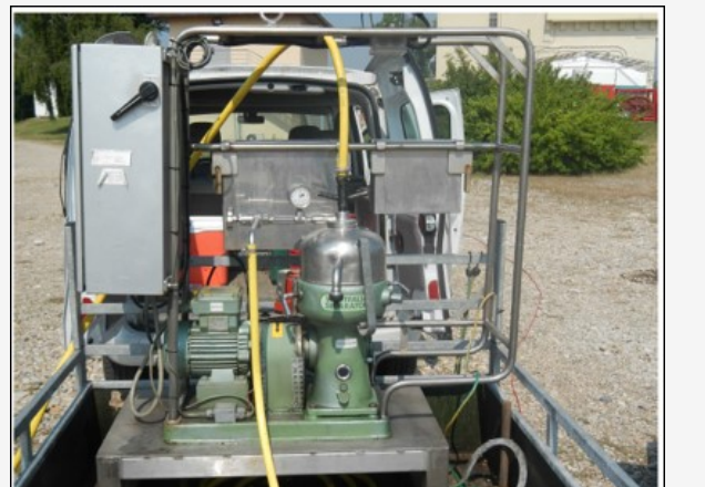
The samples were taken by continuous flow centrifugation