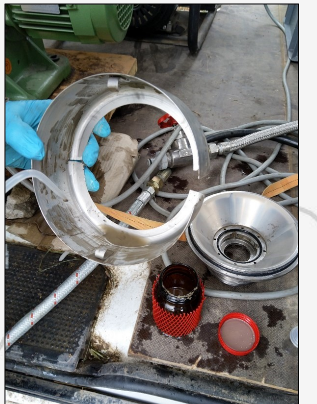
From 3 to 5m³ of centrifuged water for less than 10g of material