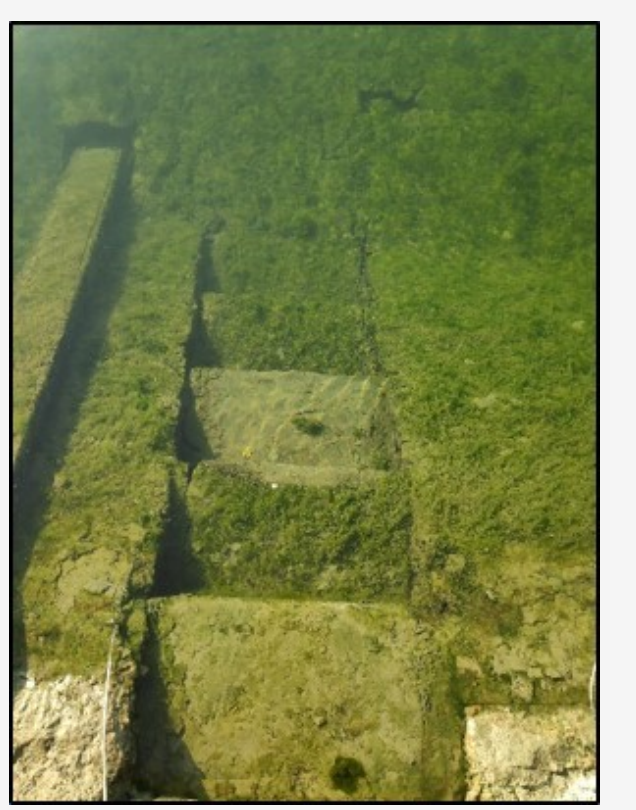
Presence of autochthonous organic matter on the Saône