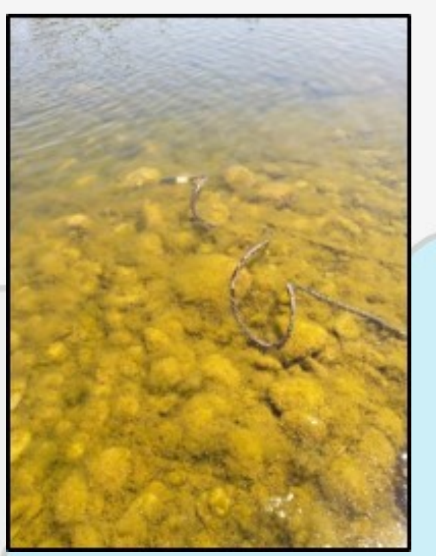
Bloom of chlorophyceae in the Ardèche River in July 2019