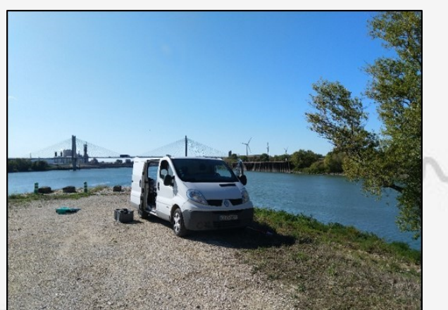
Two samples were collected per station between July and October 2019

Concentrations less than, equal to or greater than 95% of those observed for higher flows