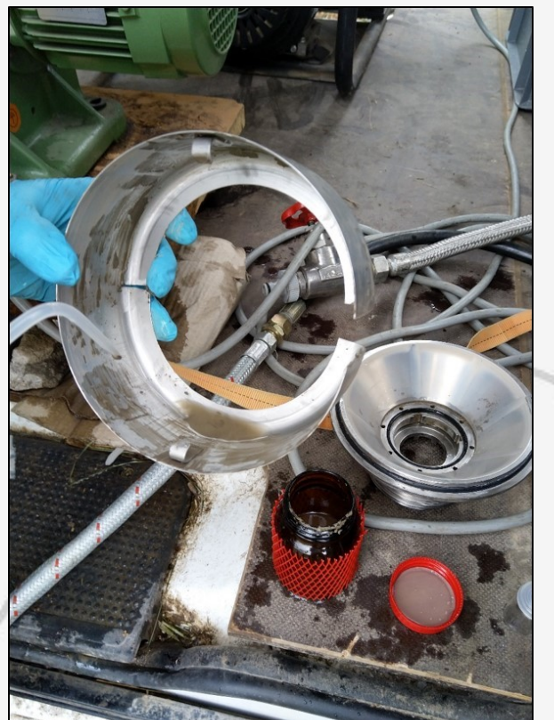
From 3 to 5m 3 of centrifuged water for less than 10g of material