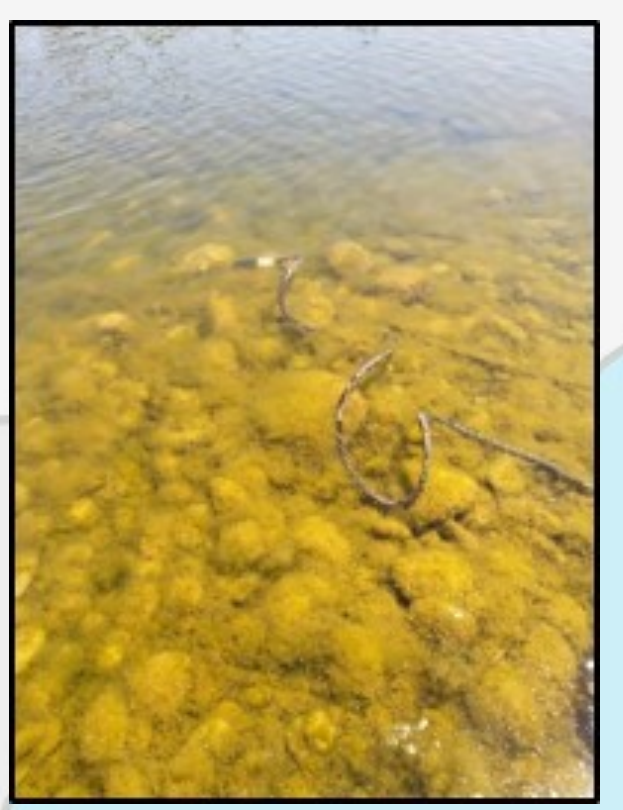
Bloom of chlorophyceae in the Ardèche River in July 2019