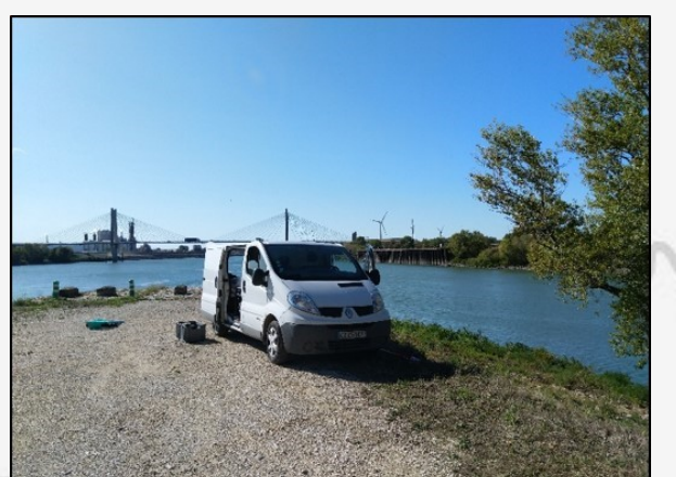
Two samples were collected per station between July and October 2019

Concentrations less than, equal to or greater than 95% of those observed for higher flows