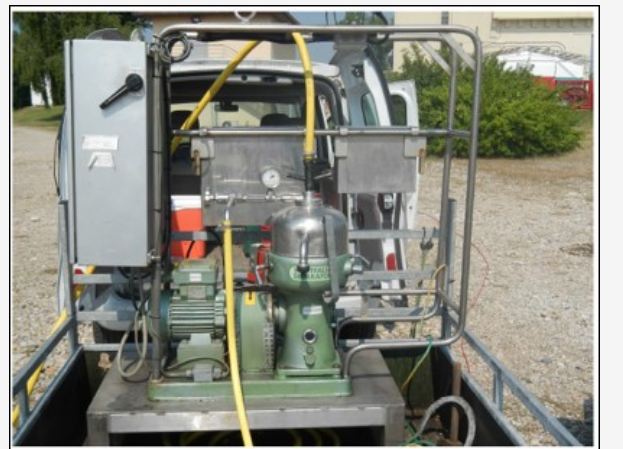
The samples were taken by continuous flow centrifugation