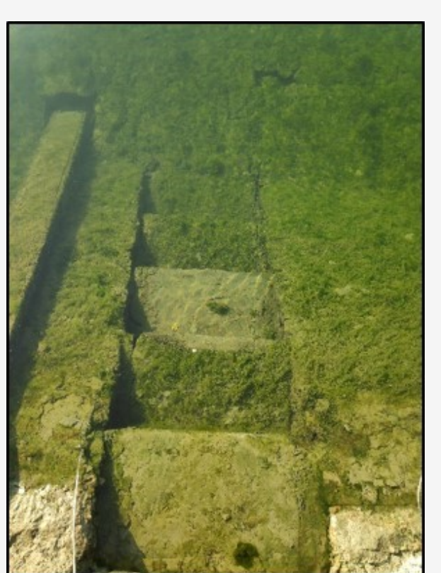
Presence of autochthonous organic matter on the Saône