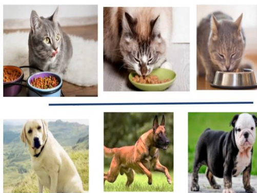
Fig. 2 Example of bias.

In the following example, a “cats and dogs” dataset presents several biases: all cats are represented with a food bowl, all of them are idle and inside a house, and they are essentially facing the camera (two eyes are visible); all dogs are pictured outside over a green background.