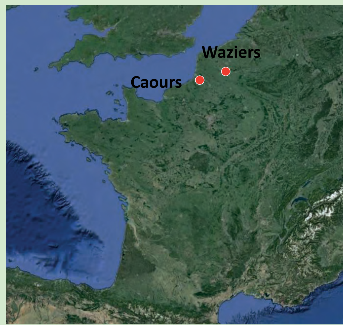
Figure 1 - Location of the studied sites in Northern France

ESR/U-series dating method was hence applied on teeth recovered from different levels of the two sites, in the aim to evaluate the quality of the results obtained in very clearly chronologically constrained stratigraphic sequences. The results obtained will be displayed and discussed in this poster.