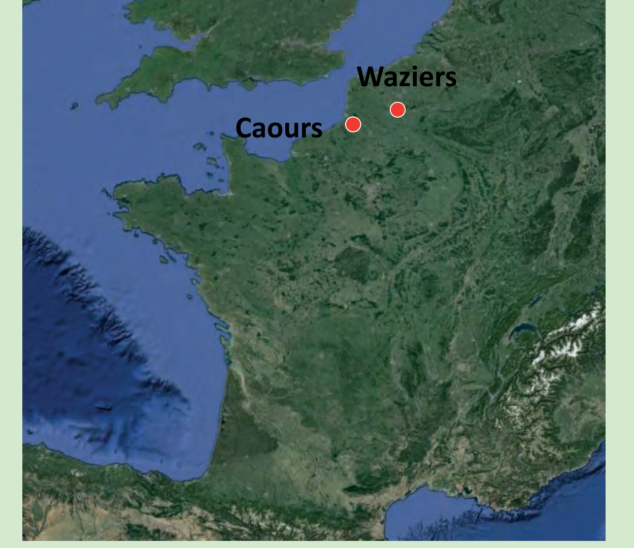
Figure 1 - Location of the studied sites in Northern France

ESR/U-series dating method was hence applied on teeth recovered from different levels of the two sites, in the aim to evaluate the quality of the results obtained in very clearly chronologically constrained stratigraphic sequences. The results obtained will be displayed and discussed in this poster.