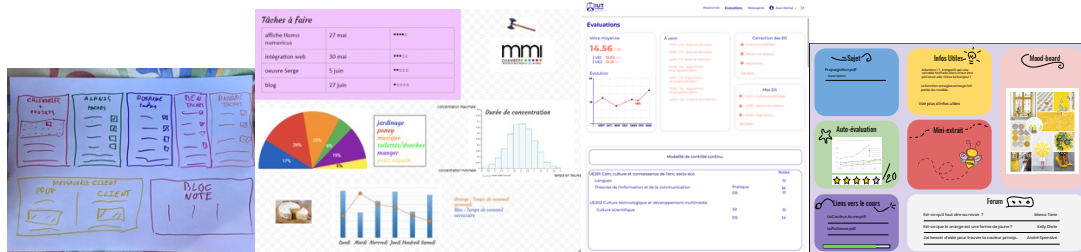
Figure 3: Examples of LAD designed with PADDLE and ePADDLE

However, by reusing the original evaluation questionnaire (Dabbebi et al., 2019), according to user evaluation (see Table 2), ePADDLE was rated a bit lower than PADDLE used in in-person sessions, significantly so regarding help to creativity where the tool could not compete with a real paper whiteboard.