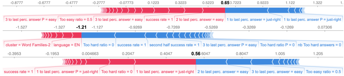
Figure 1: Feature impact in the prediction of each class for a randomly chosen trace in the testing pool. Top: “Too easy” class, middle: “Too hard” class, bottom: “Just-right” class.