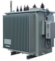
Figure 2: Electromagnetic transformer

The second benchmark corresponds to an optimal control one [9], for which the size (number of inputs/outputs) can vary according to the chosen energy horizon management in days. The goal of this benchmark is to optimize a heating power, so that a building room temperature is kept above a threshold value for each hour of k days, with k the chosen energy management horizon, according to other collected data related to the building (outside temperature, sun power, room occupants power).