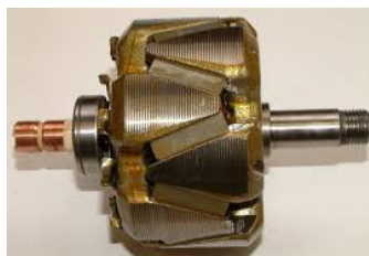
Figure 3: Claw-pole generator [11]

The design specifications of these benchmarks are summarized in Table 1 , showing the increasing problem complexity.