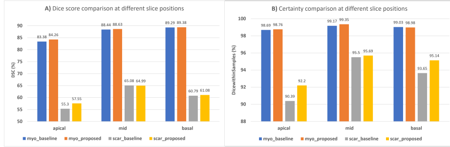
Fig. 2. Dice score (A) and certainty (B) comparison of the baseline and proposed method at different slice locations. Myo_baseline and Scar_baseline refer to myocardium and scar Dice score or certainty of the baseline method respectively. Similarly, Myo_proposed and Scar_proposed refer to myocardium and scar Dice score or certainty of the proposed method.

Regarding the probability calibration, the proposed method produced more calibrated probabilities than the baseline method on both myocardium and scar as it yielded lower Brier score. This suggests that using MC-dropout during training and the addition of uncertainty information to the loss can improve not only the segmentation accuracy but also the calibration of the probabilities.