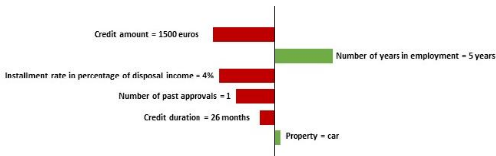
Variable importance for the refusal decision

The graph below gives the variables that impacted the algorithmic decision. A green bar indicates that the variable had a positive impact on your credit application, i.e. the variable increases the chances of approval of your application. On the contrary, a red bar indicates that the variable had a negative impact on your credit application, i.e. the variable decreases the chances of approval of your application. Finally, the bigger the size of the bars, the greater the influence of the variable on the processing of your application.