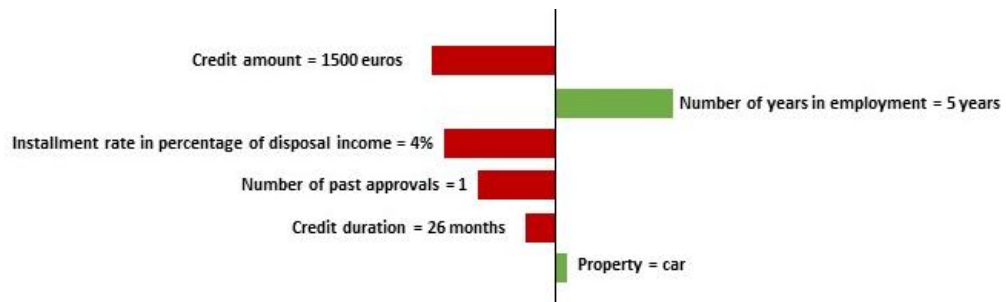
Figure 1: Variable importance (Shapley values) for 6 features involved in a AI model

black-box AI decision (refusal of credit demand), giving Shapley importance values for 6 variables inside the AI model.