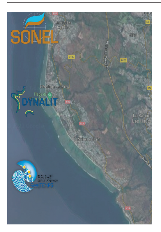
Fig. 2. Hermitage lagoon site, one of ILICO's overseas integrated multiple instrumented pilot sites involving SONEL, DYNALIT and REEFTEMPS networks. Discussions and planning to integrate other networks (such as SOMLIT and CORAIL) are ongoing.

Fig. 1. The north west mediterrenean is a hotspot for ILICO network sampling sites and activities. As well as the dedicated MOOSE network, all other ILICO metropolitan networks have sampling sites in the region.