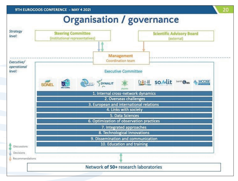
Fig. 3. Organizational structure and governance of the ILICO Research Infrastructure detailing federated observation networks and priority cross cutting actions.

The long-term data series produced facilitate another of ILICOs missions which is to foster interactions between our in situ observation community with members of other communities such as modelling, remote sensing, experimental approaches. ILICO's pluri-disciplinary research community, and its members are distributed in over 50 French research laboratories in Metropolitan France and overseas. Providing a forum for its community to work together on priority issues is a challenge, and ILICO's organizational structure and governance is designed accordingly. The strength of this network is to feed scientific synergy and drive 10 working groups on cross cutting priority actions.