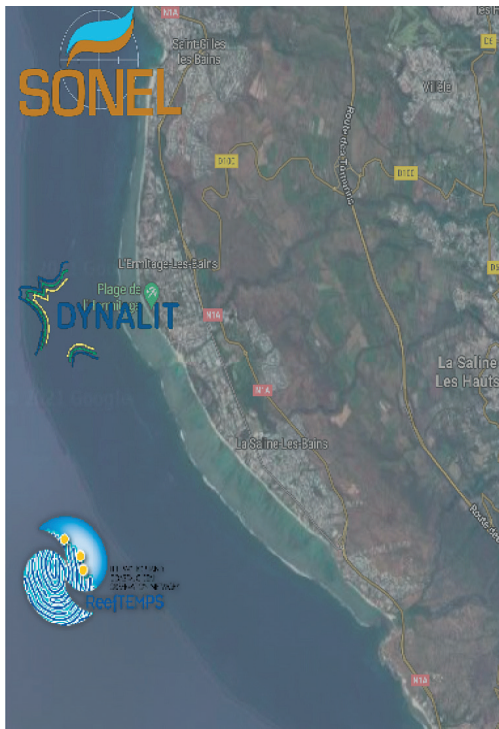
Fig. 2. Hermitage lagoon site, one of ILICO's overseas integrated multiple instrumented pilot sites involving SONEL, DYNALIT and REEFTEMPS networks. Discussions and planning to integrate other networks (such as SOMLIT and CORAIL) are ongoing.