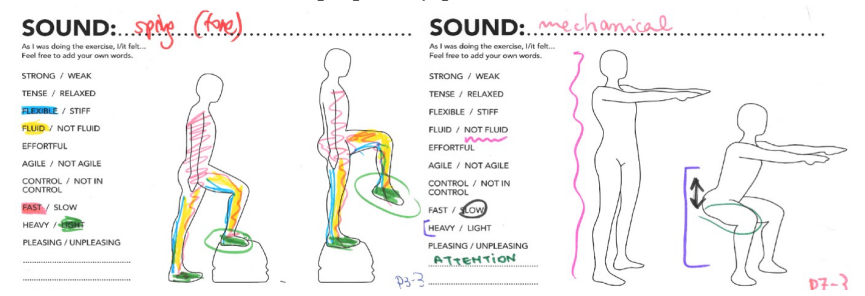
Figure 2: Two filled Contextual Body Maps, one depicting how the Tone sound has affected P3-AP's body perceptions during step-ups; the other depicting the same for the Mechanical sound during P7-AP's squats.

Use of Body Maps: The IP study featured a simplified version of the Body Map used in the AP study and was part of the documentation that participants took home (as presented in Figure 3). The Body Map was simplified because the participants had the free choice about which exercise to perform, so the Body Maps had to be without exercise contextualization. This was also to avoid that people may perceived the exercise to be above their capabilities (e.g.,