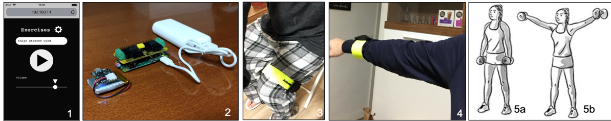
Figure 1. (1) User interface of the web application; (2) R-IoT with battery, and Raspberry Pi Zero with portable battery; (3-4) examples of a participant using the sonification band, when it was placed on their thigh (3) for squat, arm (4) for lateral raise, and an example of calibration in which the start exercise position (5a) and end position (5b) are recorded and stored.

Wearability: Prior to the studies with the participants two authors explored the wearability of the prototype (SoniBand), trying different combinations of movement, sounds, and limbs to locate where would work best to place the SoniBand during the exercises. That is, to capture the angular movement characterizing the specific exercises, and to know where would be more comfortable the SoniBand to wear.