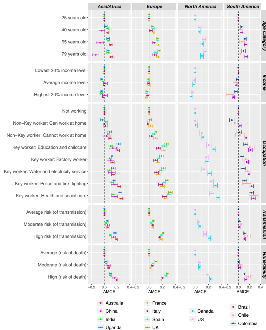
Fig. 2. Vaccine candidate decisions by country. AMCEs are reported for each attribute value. The 95% CIs are shown for each point estimate, clustered by subject. Models are weighted to reflect the respective national populations, excluding India and Uganda, which represent primarily urban samples.

correlations are suggestive; the public in weak-capacity states seem to be more enthusiastic about private provision than is the case in the higher-capacity states in our sample.