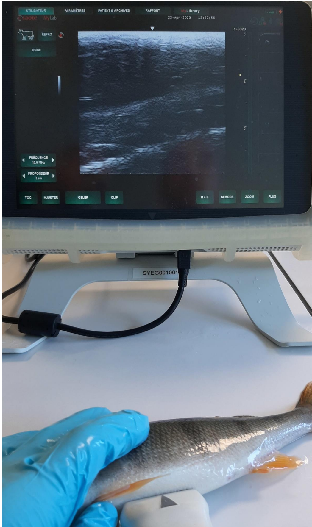
Figure 1. Ultrasound device and scanning area on an anaesthetized Eurasian perch ( Perca fluviatilis )