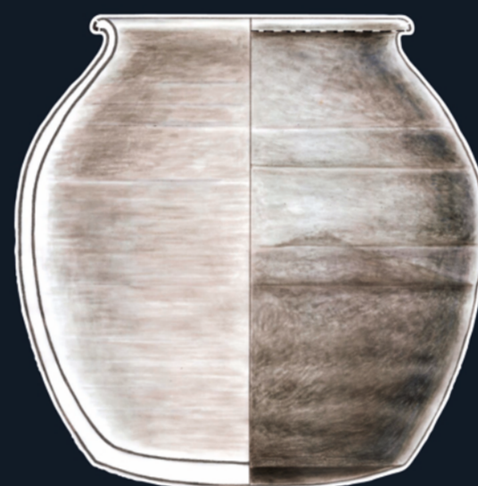
7 Medieval ceramic, La Rue, Gilly, Canton Vaud.

• The opposite table (Fig 2.) shows archaeological conservation areas in which surveys could be conducted.