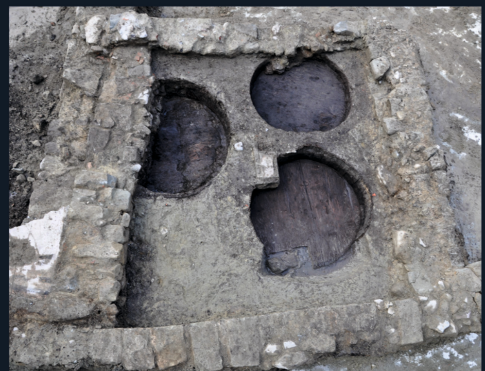
6 Tannery barrels, Rôtillon, Lausanne, Excavation 2010-11