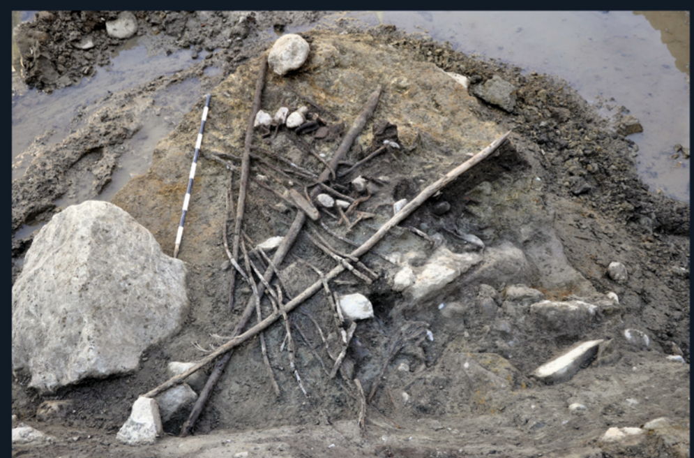
5 Wooden fence, Rôtillon, Lausanne, Excavation 2010-11