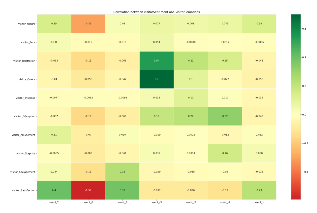
Figure 3: Pearson correlation scores between the visitor's overall satisfaction score in the conversation (vsent) and the presence of specific emotions in the messages' emotion flow (visitor_[emotion]).

Figure 3 presents the Pearson correlation scores between visitor's emotions and satisfaction for the Customer Service Live Chats. While emotions are labeled for each utterance in conversation, satisfaction is a global label for the whole conversation. This Figure shows the correlation scores are higher when the emotion is extreme within a given polarity. For instance, anger is greatly correlated to a negative satisfaction score (vsent -3) than fear or disappointment, while "Satisfaction" is more correlated to a positive overall satisfaction score (vsent +3) than "Amusement" or "Relief" are to intermediate satisfaction scores (vsent_1 or vsent_2).