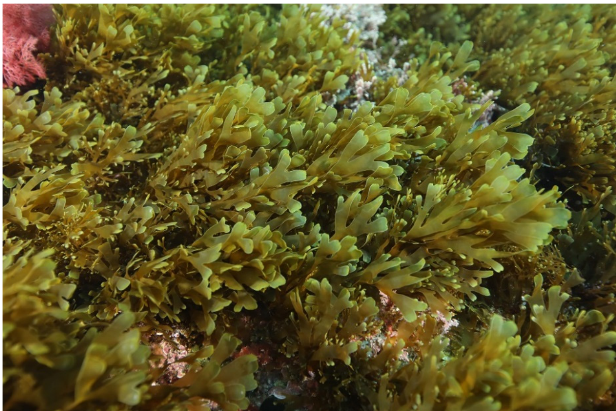
Figure 4. Rugulopteryx okamurae in February 2019.