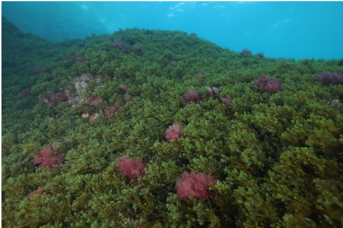
Figure 3. A rocky reef carpeted with Rugulopteryx okamurae in February 2019. Red seaweeds are Sphaerococcus coronopifolius Stackhouse, a native species.