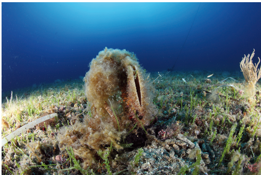
Figure 1. Living pen shell Pinna nobilis in the concerned area off the south coast of Port-Cros Island, August 2020.

pen shells were observed between 23 to 27 m depth distributed over an area of approximately 1 000 m 2 (Table I). In the same area, 42 dead pen shells were observed (Fig. 2). The bottom is constituted of detritic sediment together with bryozoans and shell debris and free-living calcified red algae (Corallinales). This community is characteristic of Mediterranean detritic soft sediment exposed to deep-sea current. The colonization by the invasive green alga Caulerpa cylindracea Sonder is extensive (Fig. 2).