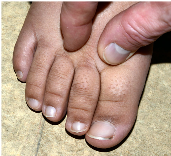
Fig. 2 Stemmer's sign: inability to pinch the skin on the base of the second toe