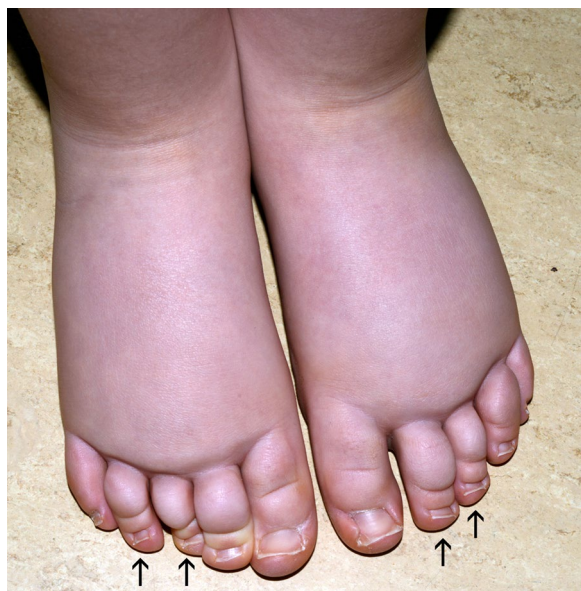
Fig. 3 Bilateral lymphedema of a 4-year-old girl with lower-limb lymphedema present at birth, upslanting nails, brachyonychia (arrow)

retardation for a girl and renal or cardiac malformations). Taking photos for follow-up is helpful.