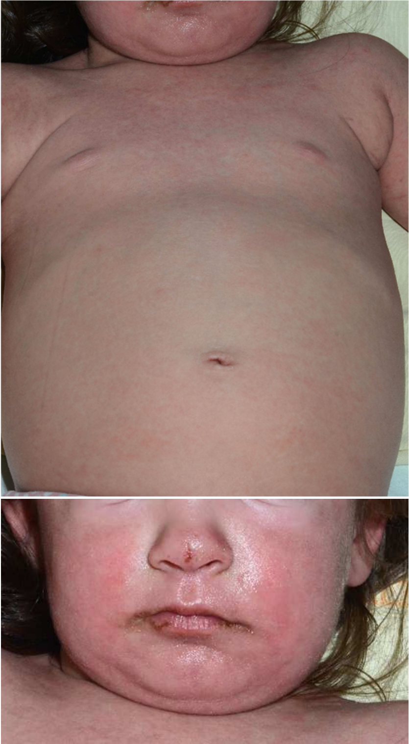
Figure 1 : 3 years old child with diffuse maculopapular rash, facial edema and cheilitis.