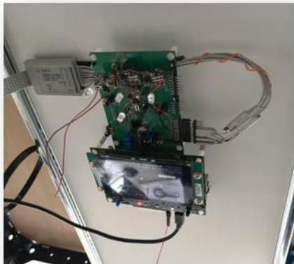
• Access point @TRL4