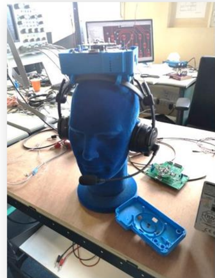
• Headset + Station @TRL4